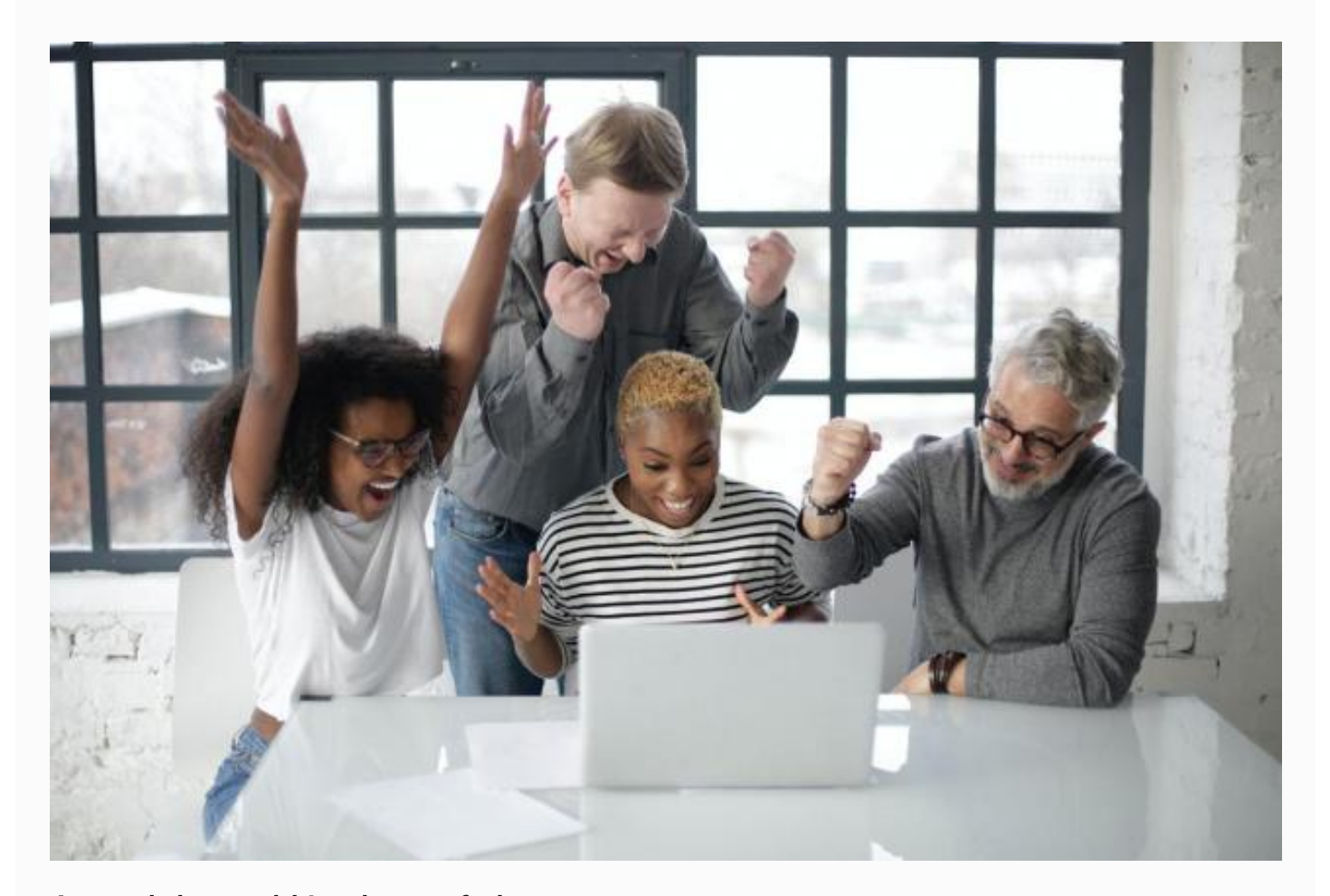
Around the world in plenty of plays