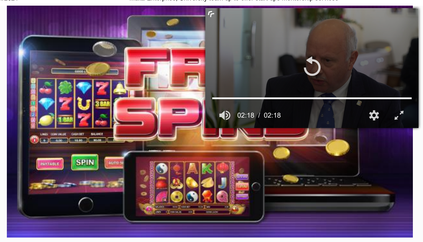
Are big bonuses big news?